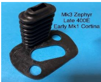
+ Mk1 Cortina