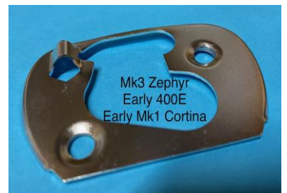
+ Mk1 Cortina